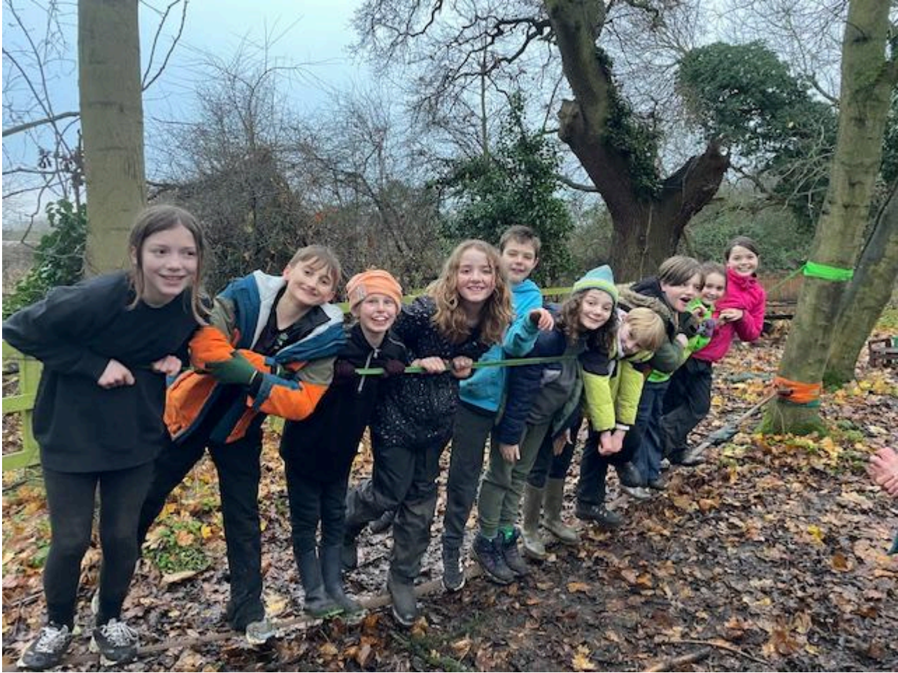
Year 5 and 6 have enjoyed their Forest School sessions this term.