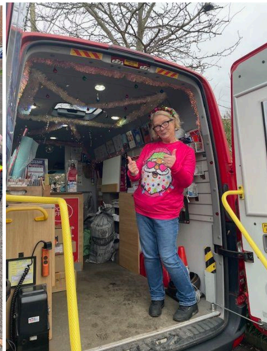
The Reception and Year 1 children have been to see our local Post office.

Working Together, Aiming High, Shining Brightly