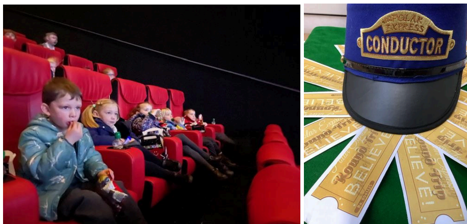
Having fun at the cinema

During Anti-bullying week, Year 3 and 4 worked hard on the theme of Respect.